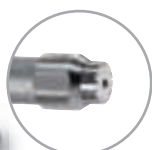
Silvent 757-L See page 108