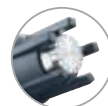
Silvent 4010-S See page 113

Robust safety air guns for aggressive environments