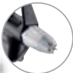
Silvent 008-L See page 94