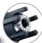
Silvent 4020-LF See page 112