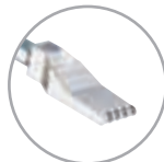
Silvent 0971 See page 95