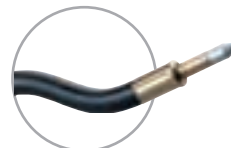
Silvent 520 See page 100