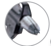
Silvent 501 L-H See page 99