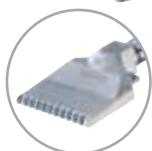
Silvent 2973 See page 104