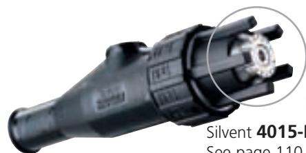
Silvent 4015-LF See page 110

Extremely powerful blowing tools for long distances