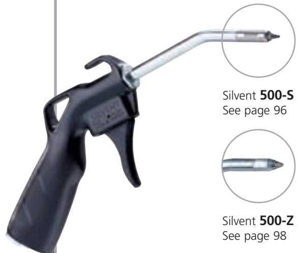
Silvent 500-S See page 96

Safety air guns with short triggers that are easy on the hand