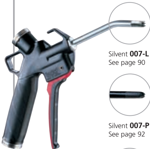
Silvent 007-L See page 90