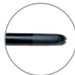
Silvent 007-P See page 92