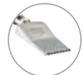
Silvent 5920 See page 101