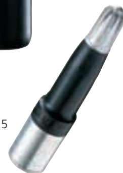
Silvent 100 See page 115