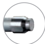
Silvent 753-S See page 109

Safety air guns for more unusual applications