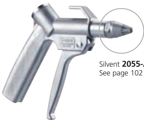
Silvent 2055-A See page 102

High force safety air guns entirely of aluminum