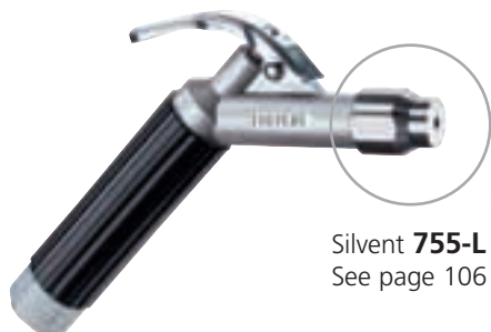
Silvent 755-L See page 106

Robust safety air guns for aggressive environments