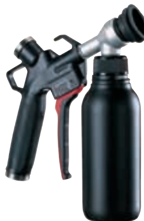
Silvent BG-007 See page 114

Safety air guns for more unusual applications