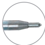
Silvent 007-MJ4 See page 93